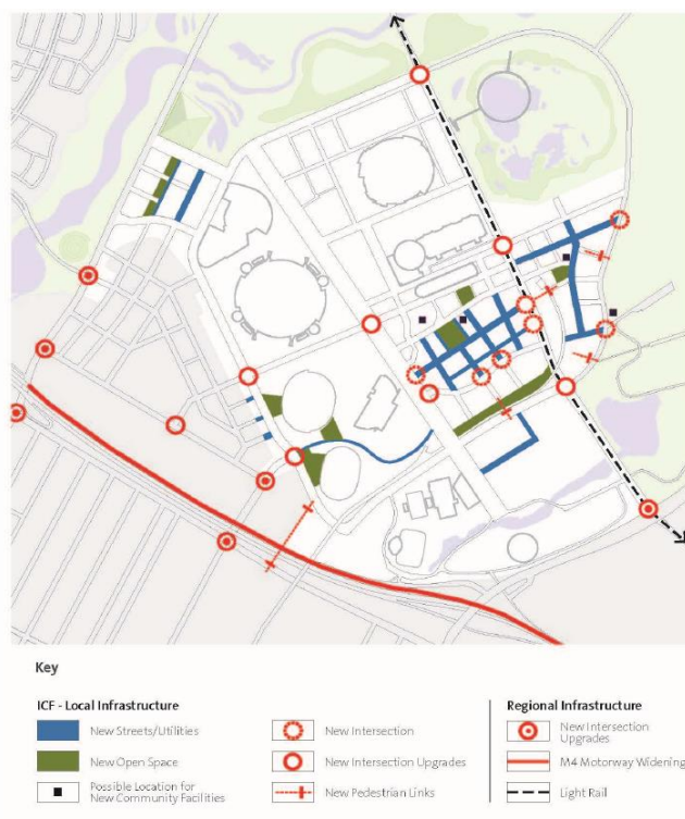
Figure 32 Proposed local and regional infrastructure to be provided at Sydney Olympic Park